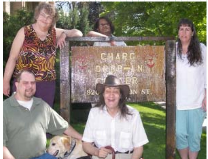
CHARG Speakers' Bureau 2009

(Based on 2004-2005 Colorado Department of Labor and Employment statistics run through a depression calculator)